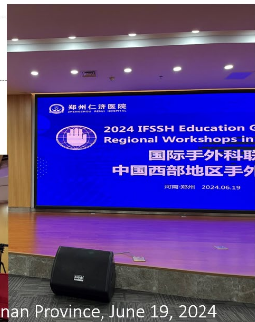
Renji Hospital, Zhengzhou, Henan Province, June 19, 2024